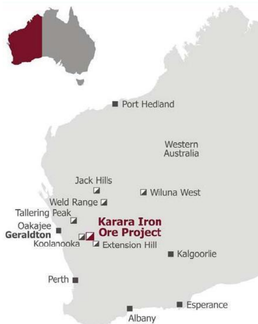
Location of Karara Mine 卡拉拉矿区位置

The Mine is located approximately 320 kilometres north-north-east of Perth. Refer to the locality maps below 矿区位于珀斯以北偏东北约 320 公里处。具体位置请参考下方地图。